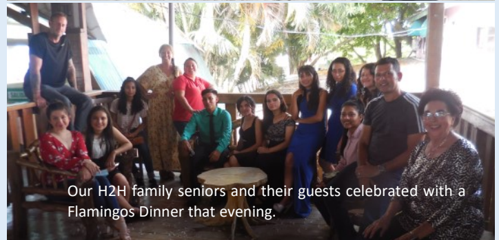
Our H2H family seniors and their guests celebrated with a Flamingos Dinner that evening.